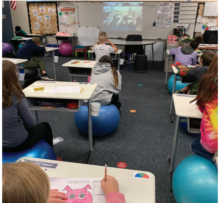
Classes will connect virtually with the Indiana State Fairgrounds and the Pig Adventure at Fair Oaks for an interactive adventure through the stages of pork production.